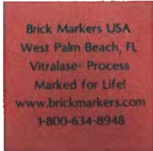
8" x 8" Text Only